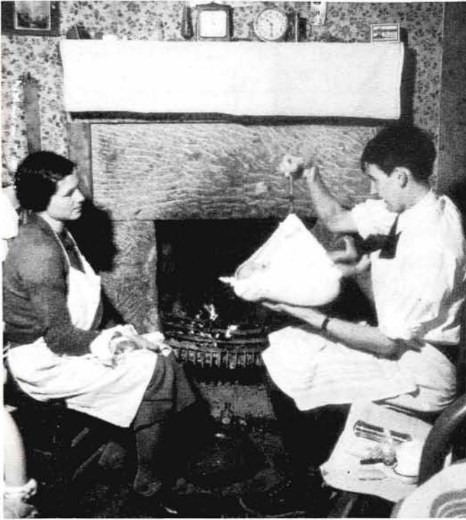
Mouth of Wilderness, 1955