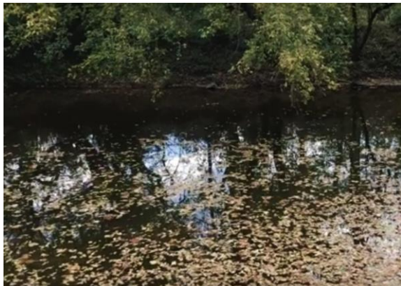
Paint Lick Creek