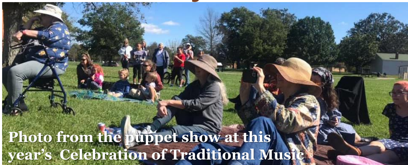
Photo from the puppet show at this year's Celebration of Traditional Music