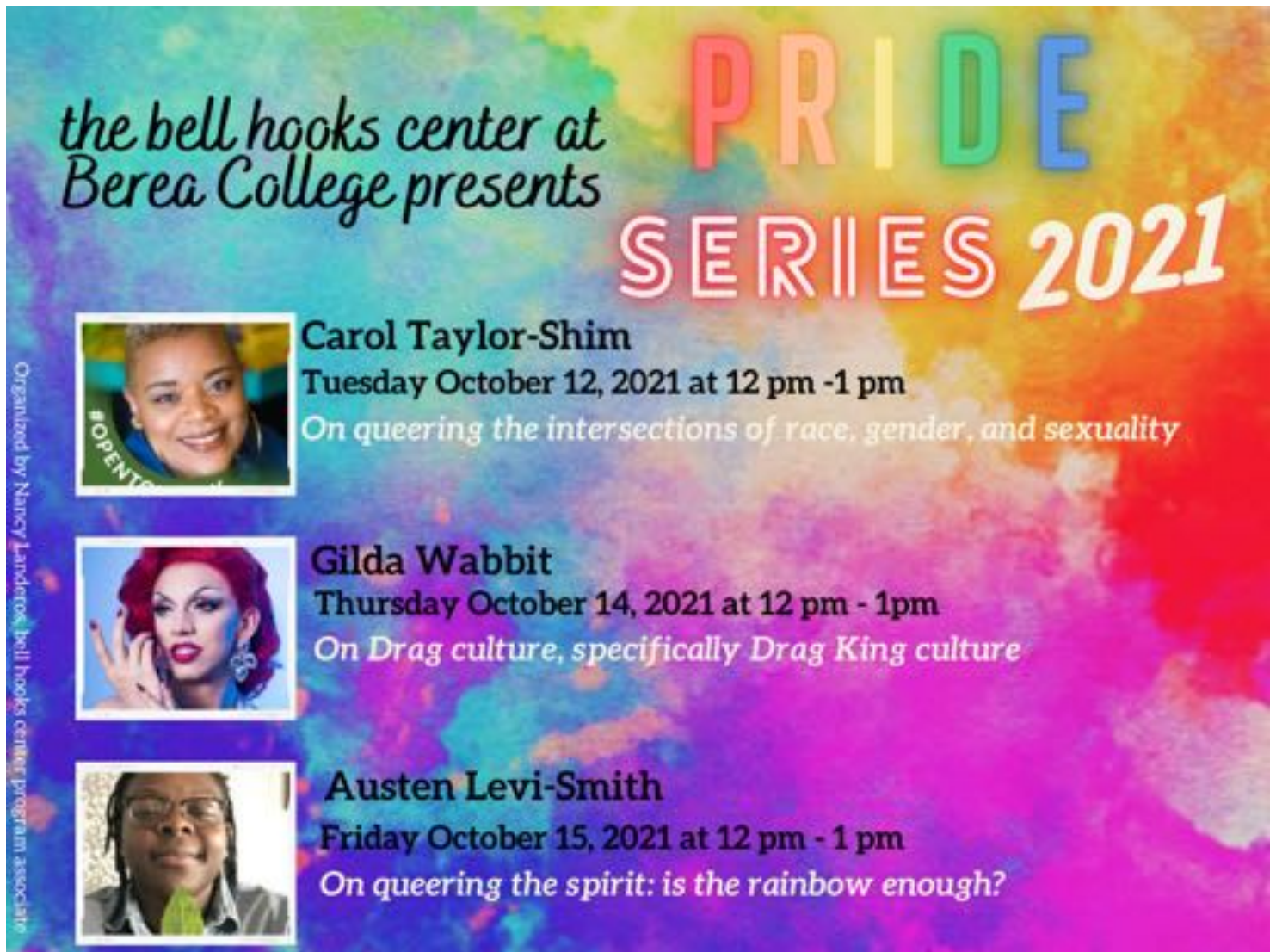
ALT-TEXT: Event poster with descriptions and images of each speaker

The below events are hosted via Zoom. Keep an eye out for email and social media announcements with the Zoom links embedded.