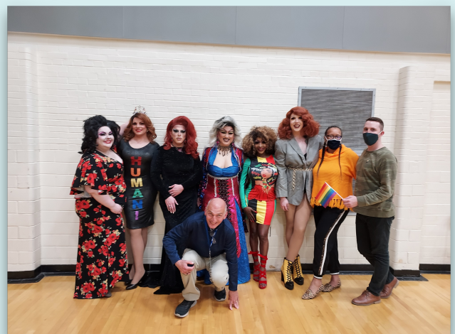
ALT-TEXT: Drag show performers and attendees posing for a photo.