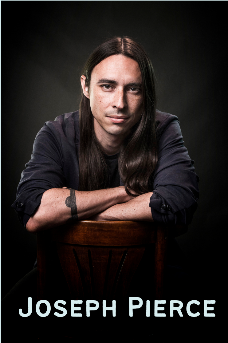
ALT-TEXT: Person sitting in a chair.

Join us virtually on November 10th, 12-1PM about the relationship between queerness, land, and sky . Look out for an announcement email with the Zoom link!