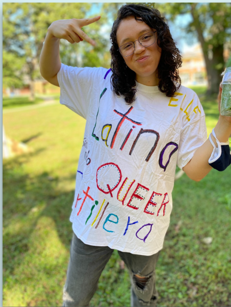
ALT-TEXT: A Berea student in a PRIDE t-shirt exhibiting a peace sign.

Many thanks to the bell hooks center faculty, staff, and labor students and our collaborators in Student Life for hosting this year's PRIDE series , which included talks about intersectionality, racialized queer spaces, and drag culture, and even a drag show! We hope you will join us next year for an uplifting PRIDE week!