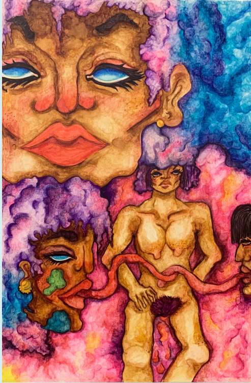
ALT-TEXT: Painting of women.