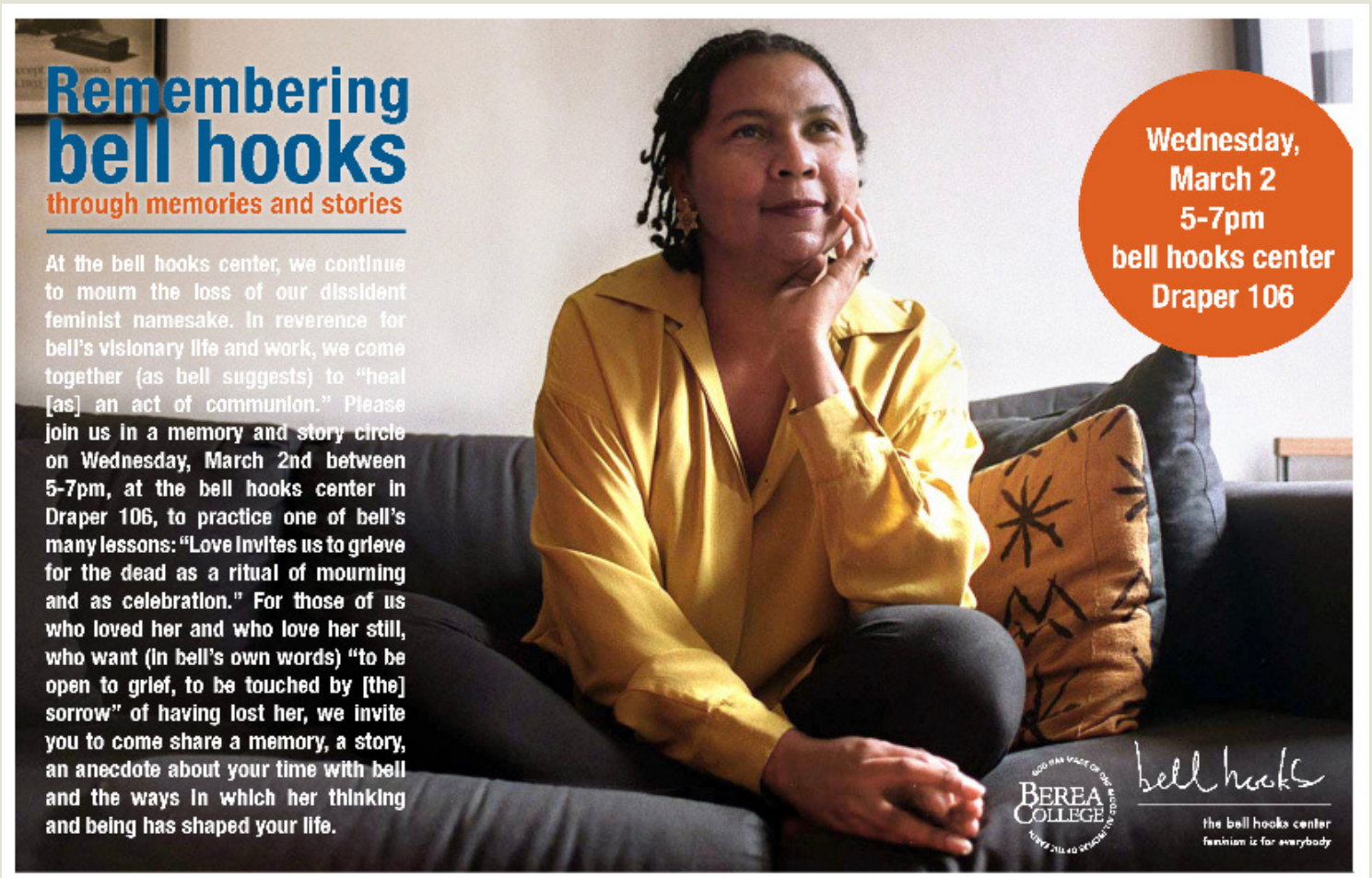
ALT-TEXT: Remembering bell hooks poster featuring bell hooks

As we continue to mourn Berea's beloved bell hooks , we will be hosting an event in remembrance of bell hooks on March 2 from 5 PM - 7 PM in the bell hooks center (Draper 106). Join us as we remember her through a memory and story circle. We invite the campus community to join us and share a memory or story of bell and how she helped shape your life and learning.