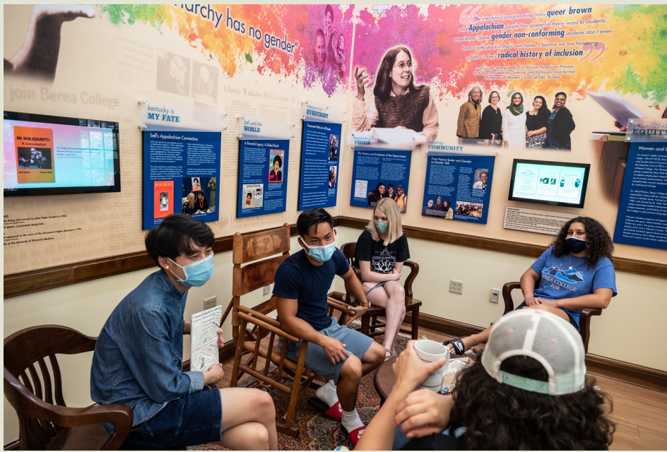
ALT-TEXT: Students conversing in the bell hooks center

Visit us in the bell hooks center Monday through Friday from 9 A.M. until 5 P.M. Our space offers comfortable seating options, such as bean bag chairs, where students can come to study or simply meet with friends.