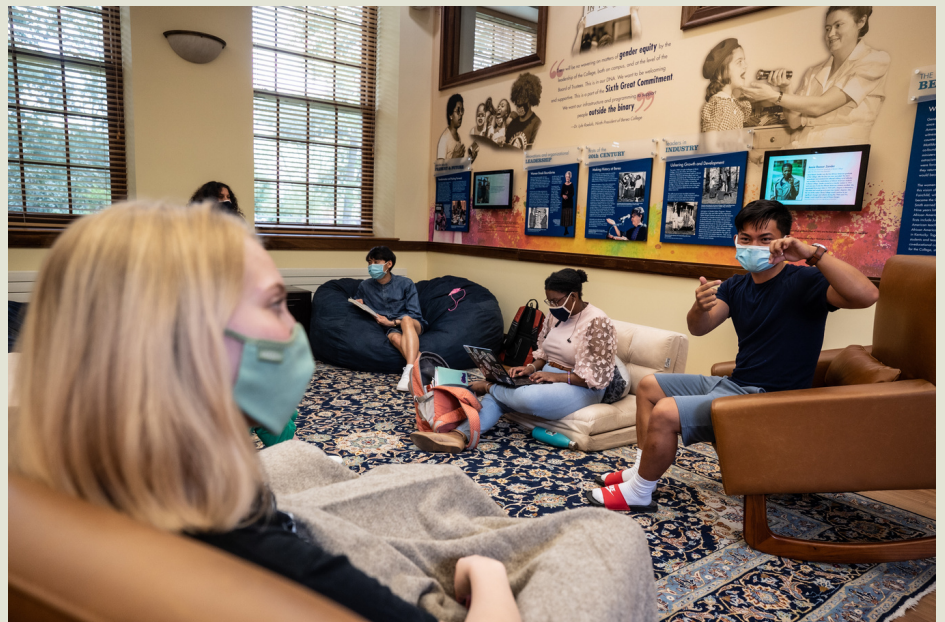
ALT-TEXT: Students relaxing in the bell hooks center

We offer a number of supplies for students by the front door. We consistently have menstruation supplies and safe sex supplies stocked. We have also added rainbow masks to the pile! Stop by and pick one up today!