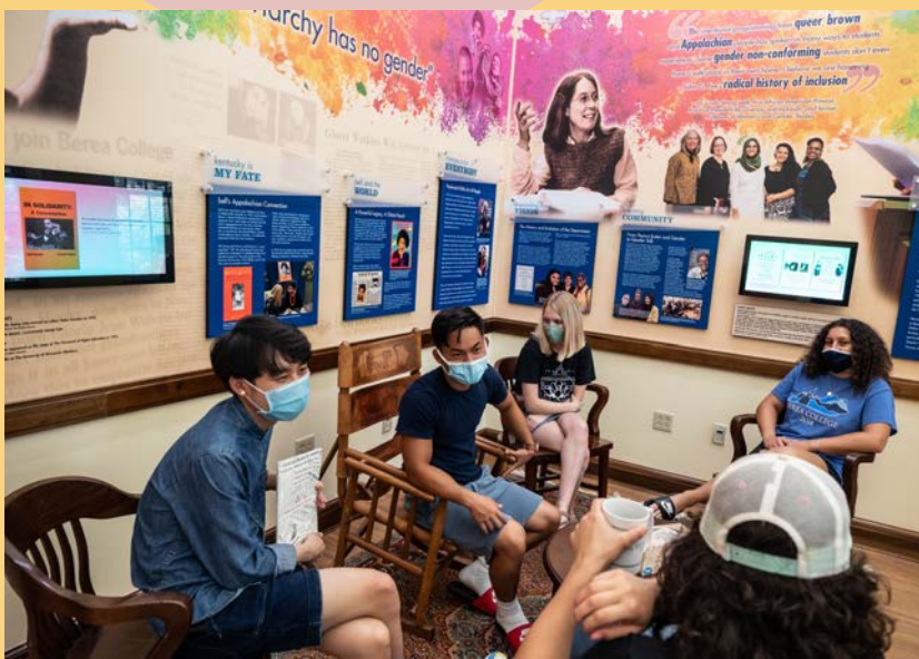
ALT-TEXT: Students conversing in the bell hooks center.

Come visit the bell hooks center in Draper 106, where you will find comfortable, accessible seating such as rockers and beanbag chairs. Come hang out with friends, to study, or to simply relax!