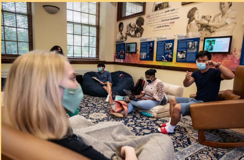
ALT-TEXT: Students relaxing in the bell hooks center.

Come visit the bell hooks center in Draper 106, where you will find comfortable, accessible seating such as rockers and beanbag chairs. Come hang out with friends, to study, or to simply relax!