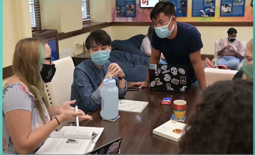
ALT TEXT: Students studying together at the bell hooks center.

We offer Pronoun pins, contraceptives, menstrual supplies, candy, and resource guides at the front desk!