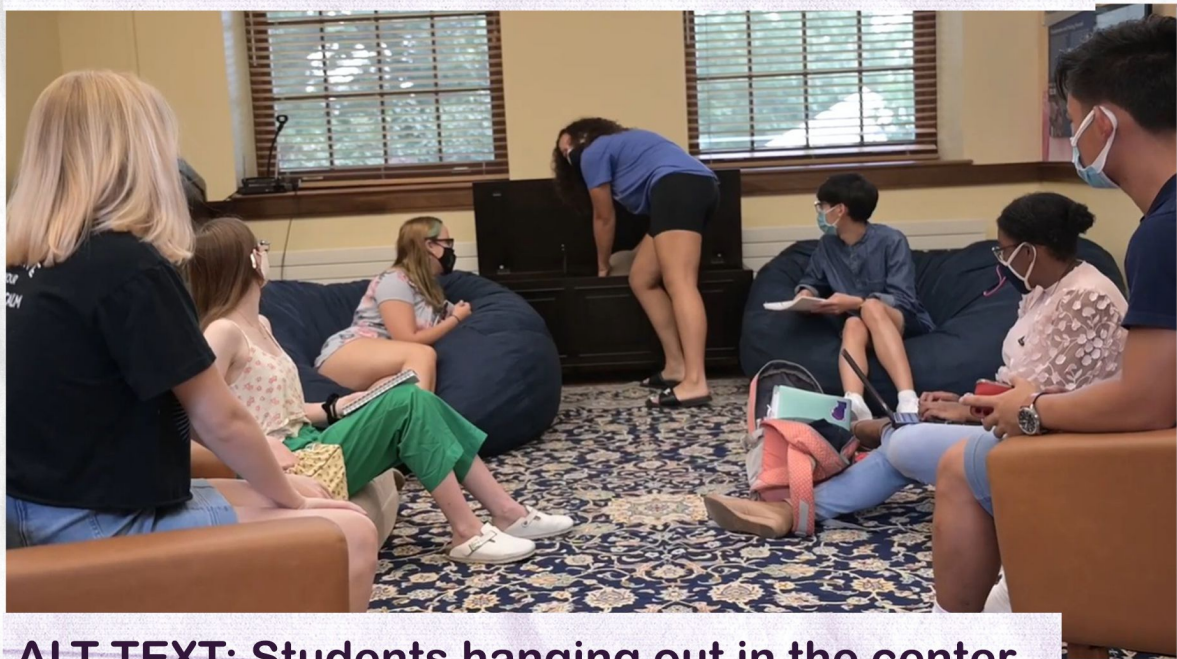
ALT TEXT: Students hanging out in the center.