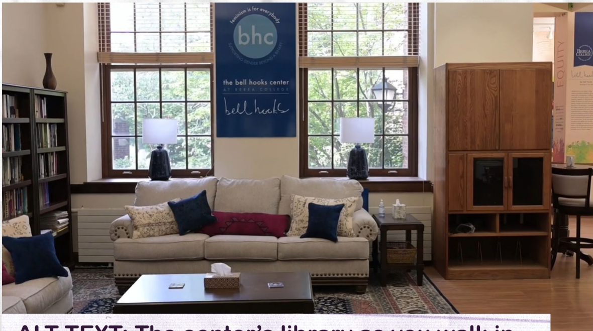
ALT TEXT: The center's library as you walk in.