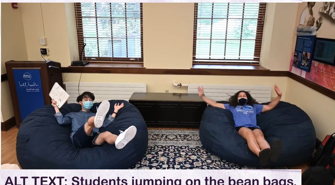
ALT TEXT: Students jumping on the bean bags.