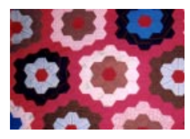
Quilts are a mainstay of the crafts industry.