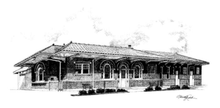
The L & N Depot, which serves as the heart of the crafts neighborhood in Old Town Berea, was renovated by Marketing Appalachia's Traditional Community Handicrafts, a cooperative of crafts organizations.

In 1976, after the catalog was published and the warehouse was established, three MATCH retail shops opened: one in a Cincinnati suburb, one in