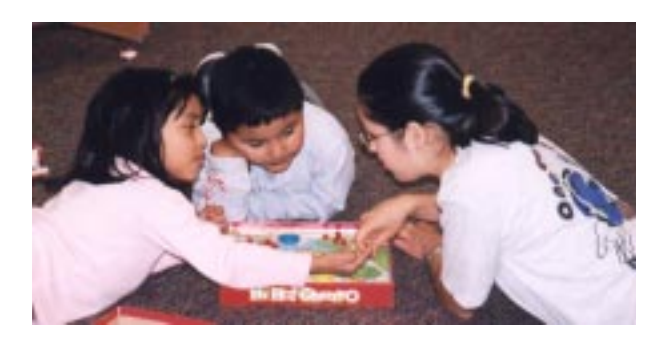
Berea College students help youngsters develop English speaking skills through fun and games as well as work.

with local schools, aims to lift the educational aspirations of Appalachian and minority youth and to help them develop their academic abilities.