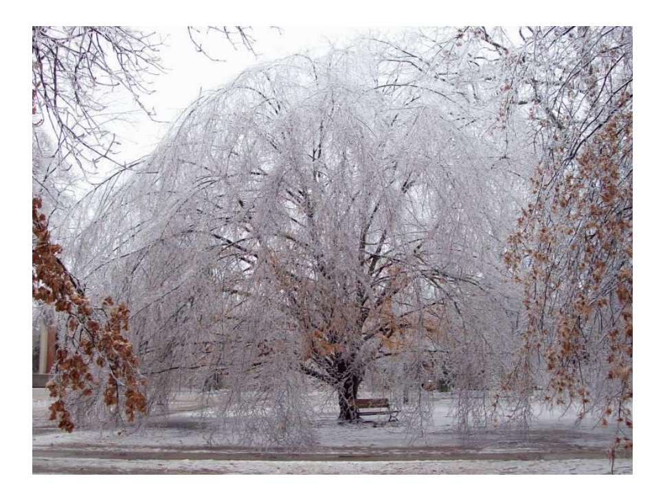
Managing for Disasters

The selection process will favor native trees proven to grow well in our region, but will also consider non-native varieties that enhance campus diversity. Invasive species are prohibited, and are determined with reference to the Kentucky Exotic Pest Plant Council invasive threat plant list. Tree selections and placements will be made by the Campus Tree Group, with reference to the Berea College Master Plan. A list of recommended species is located at the end of this document. At this time the only prohibited tree species for planting or cultivating is Ailianthus altissima (Tree-of-Heaven). There is also hesitation for any future plantings of any Fraxinus (Ash) species due to the proximity and uncertainty of the Emerald Ash Borer.