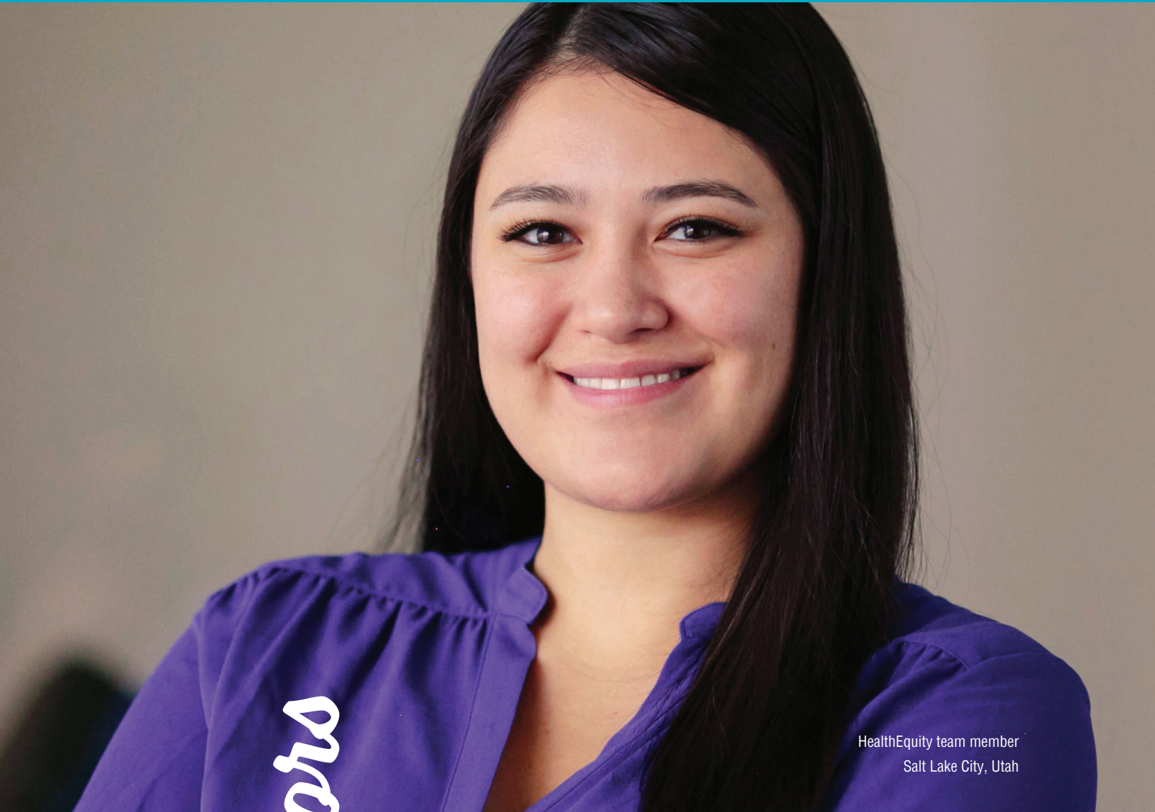
HealthEquity team member Salt Lake City, Utah