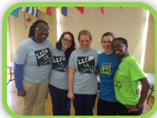
Nursing Program Junior Participants (Class of 2016)