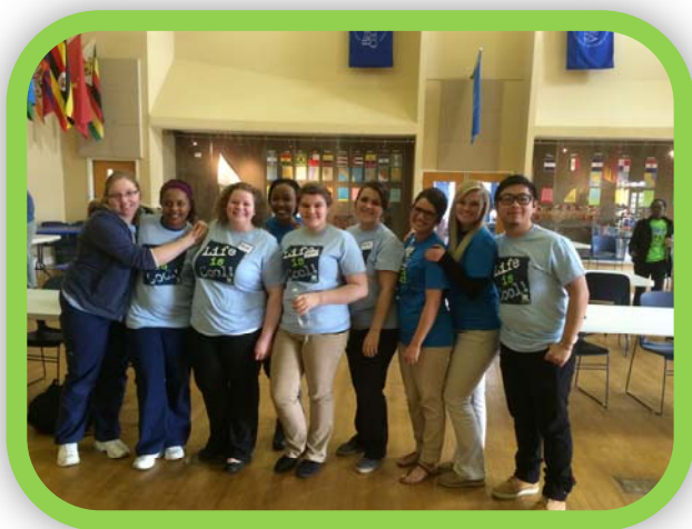
Nursing Program Sophomore Participants (Class of 2017)