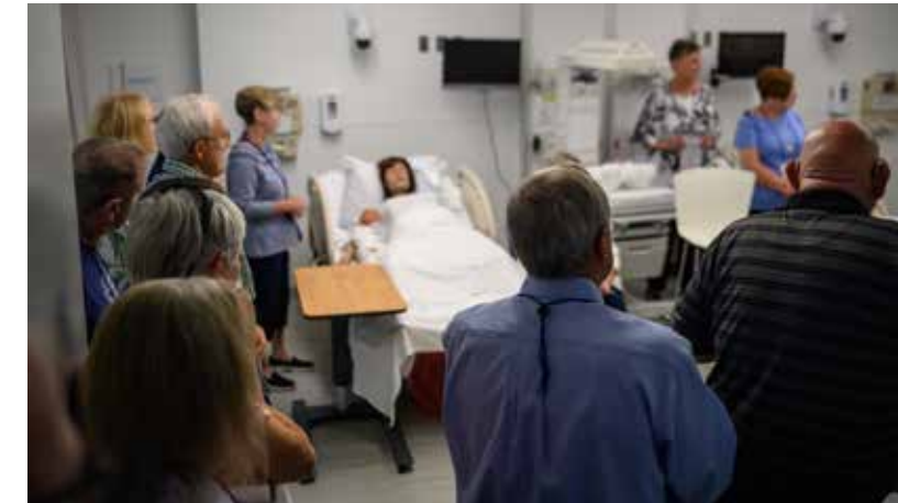
Alumni touring the maternity and pediatric suite.