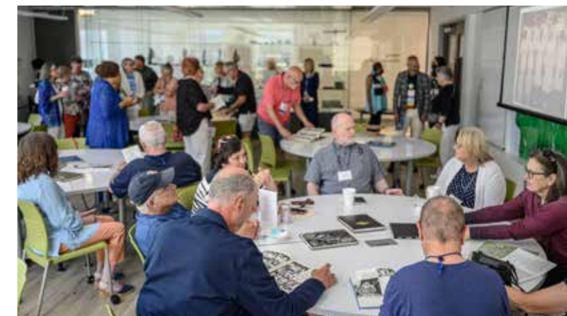
Alumni and friends engrossed in yearbook memories.