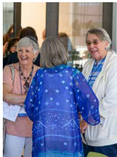
Reminiscing about old times