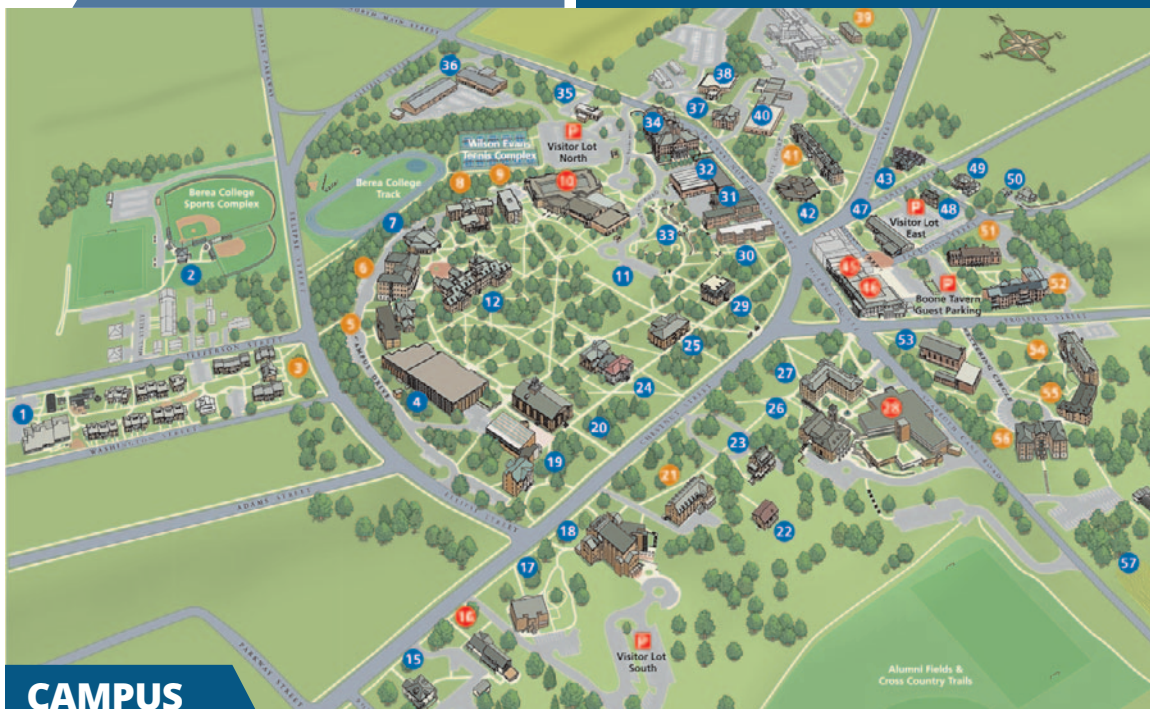
Cartography by Mapsoft.com