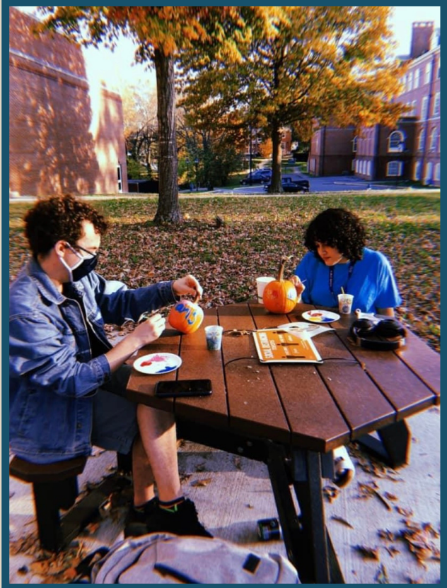
Feminist Pumpkin Painting and Carving - 2020

Pronoun pins are available upon request and will be mailed to you. Email saderholm@berea.edu to request your pin today!