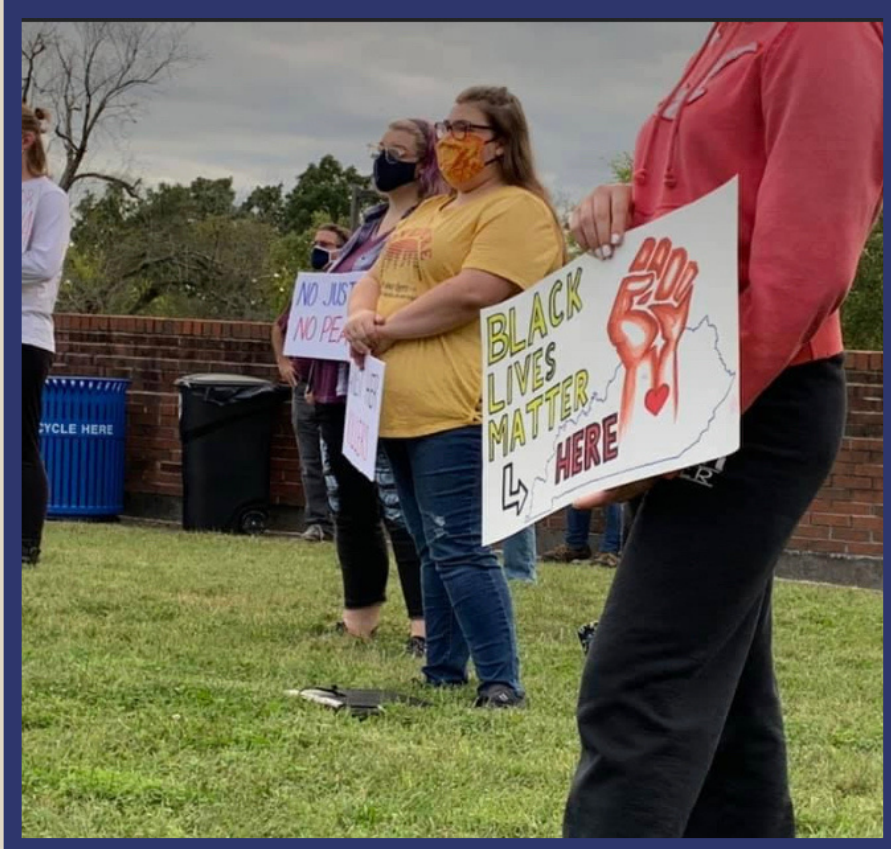
BLM Protest- 2020

"Sometimes people try to destroy you, precisely because they recognize your power- Not because they don't see it, but because they see it and they don't want it to exist"